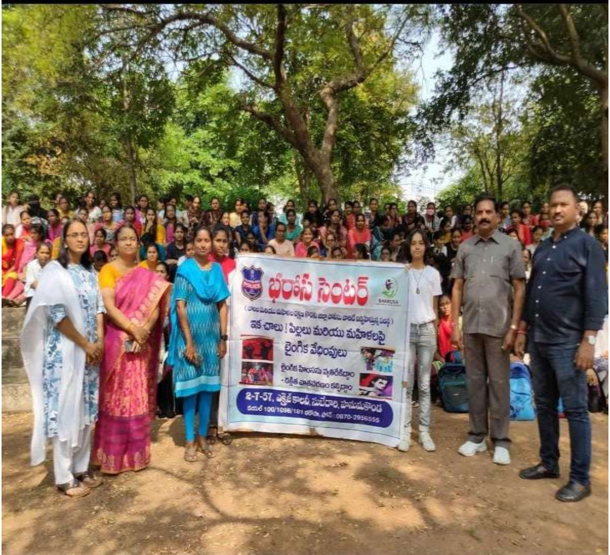
Awareness programme on Sexual harassment on Girl Child and Women