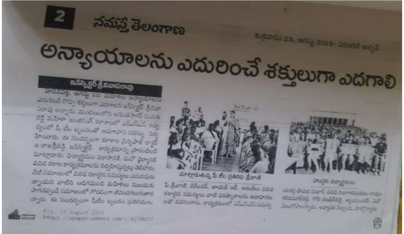
Paper clip of “Women Rising: A Force against Injustice”