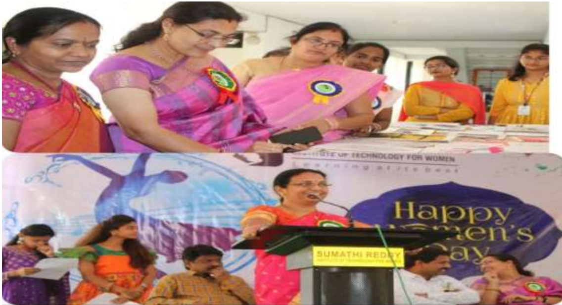
Women's day celebrations

On day 6, college has conducted the women's day, some fun events were designed to realize the women's daily household work. The purpose of the event to raise the dignity of women among the students.