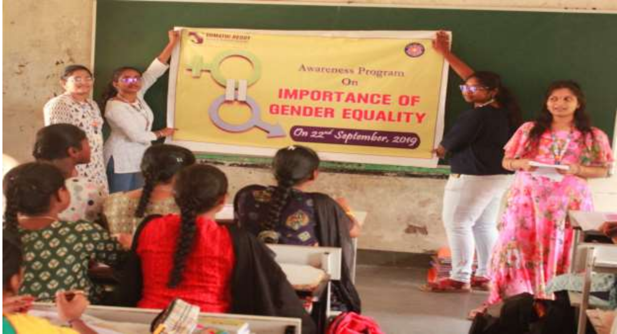
Importance of gender equality at Kasturba Gandhi Balikka Vidyalaya

SRITW has organized a program on “Importance of Gender Equality” at Kasturba Gandhi Balika Vidyalaya (KGBV) School, Bheemadevarapally. The program aims bring gender equality in education. Gender equality is linked to economic growth and prosperity. When women and men have equal access to education, employment opportunities, and resources, it can lead to increased productivity and economic development. Gender-inclusive economies tend to perform better. The speaker delivered an insightful speech on the importance of attaining equality between men and women, eliminating all forms of discrimination against women. NSS coordinator exhorted the students to understand their role in decision making and their right to practice any job of their choice. The interactive session followed in which the students stressed the importance of having economic and social freedom.