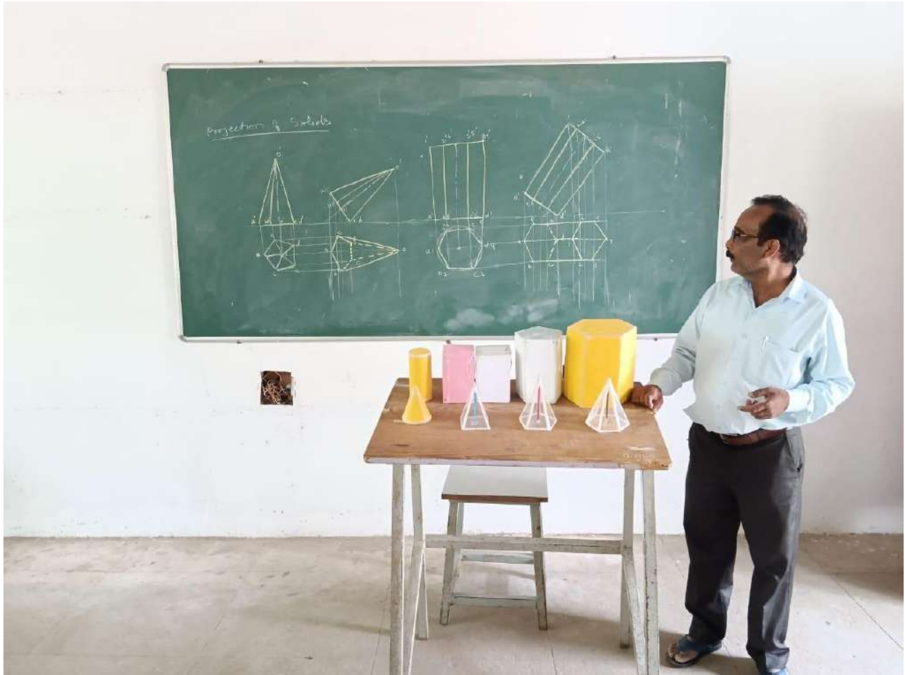
Figure 4. Faculty demonstrating projection of solids as a part of experiential learning.