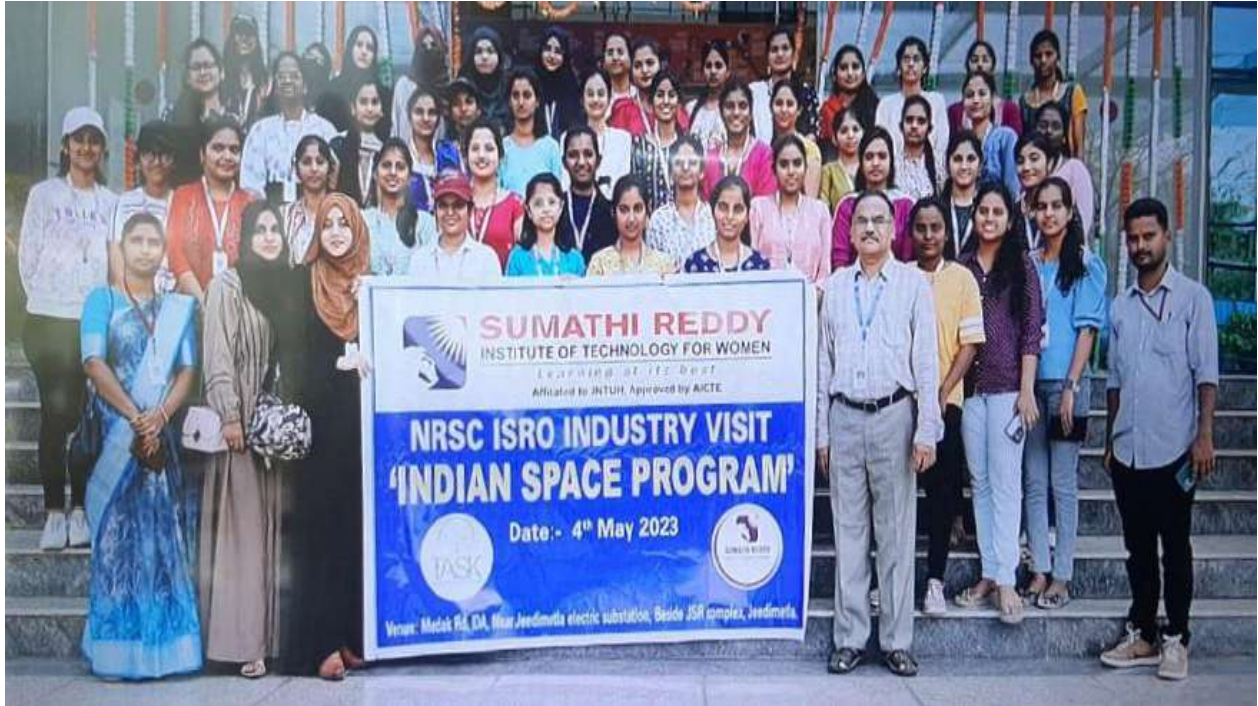
Industrial visit to NRSC, ISRO(Hyderabad) on 04-05-2023