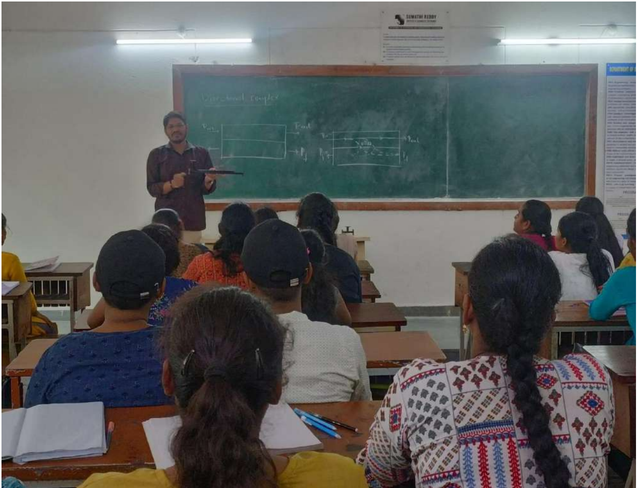
Figure 2. Faculty explaining Directional coupler as a part of experiential learning.