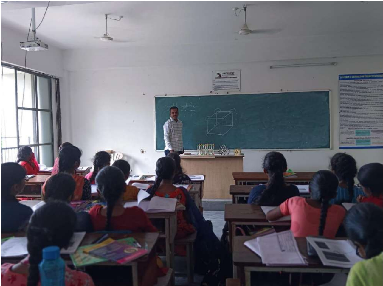
Figure 1. Faculty explaining Crystal System as a part of experiential learning.