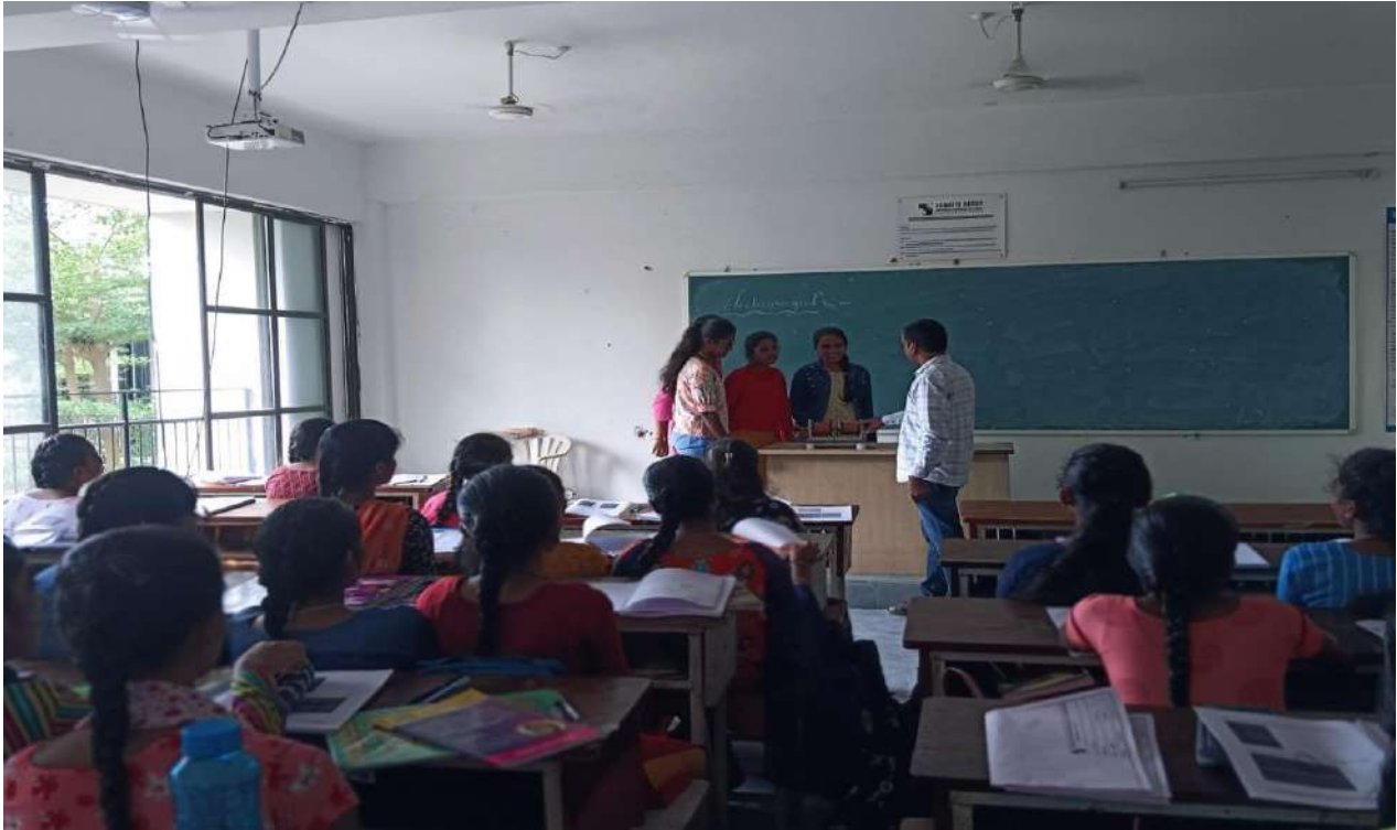
Figure 3. Faculty demonstrating electromagnet as a part of experiential learning.