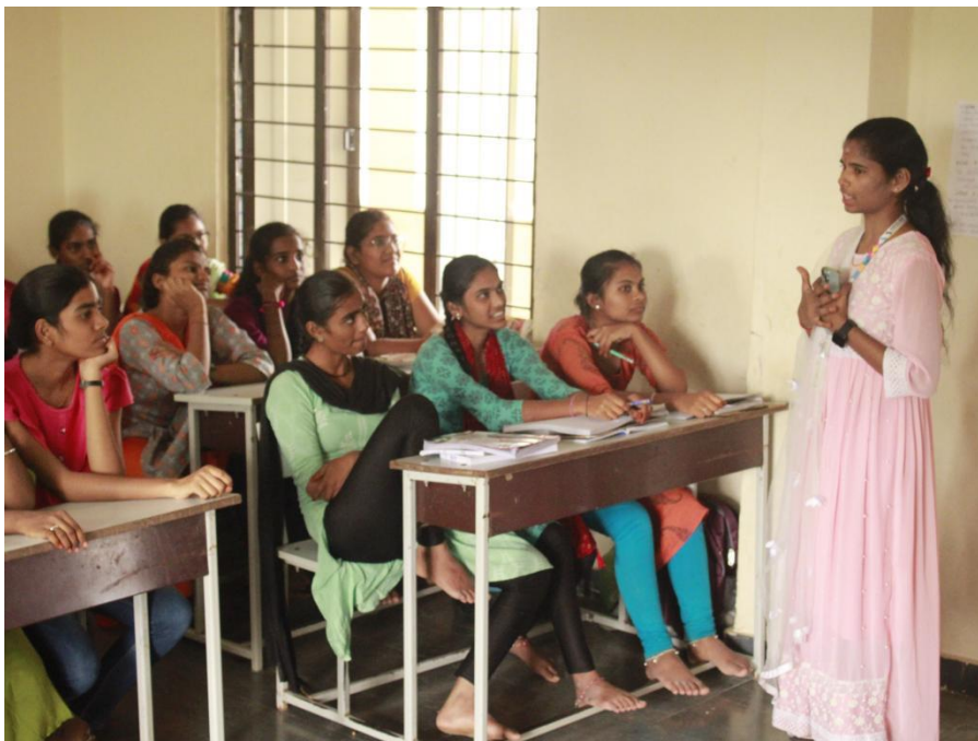
NSS Volunteer is explaining about Toilet Hygiene to the students.