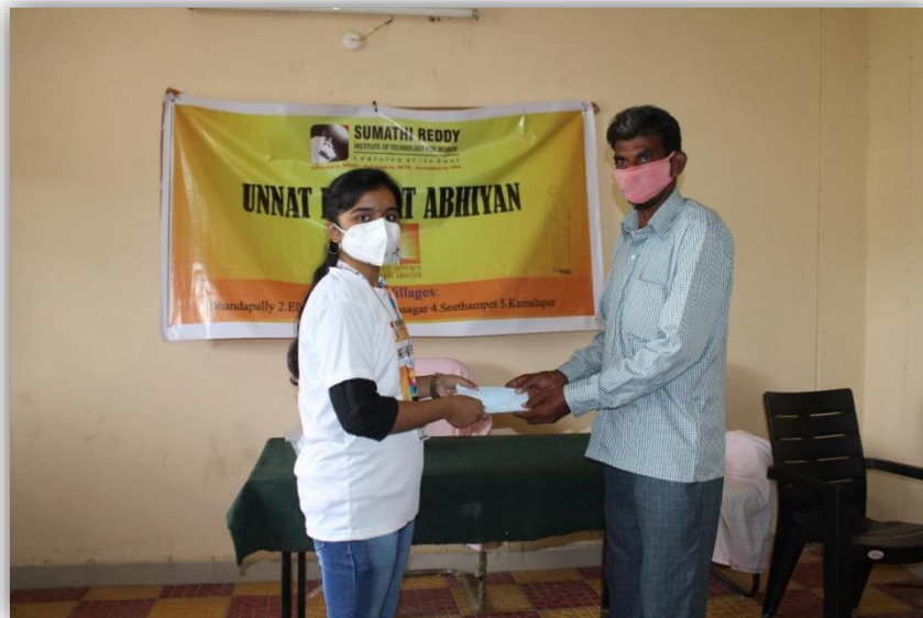
NSS Volunteer is giving safety kit to the village person

All the head of the departments participated actively in the program shared their thoughts and views to the village people about safety measures to be taken.