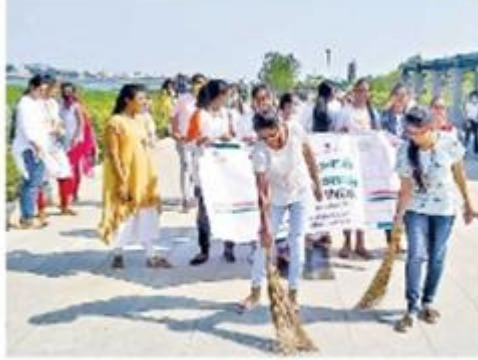
భద్రకలి బండ్లను శుభ్రం చేస్తున్న ఎన్ఎస్ఎస్ వాలంటీర్లు