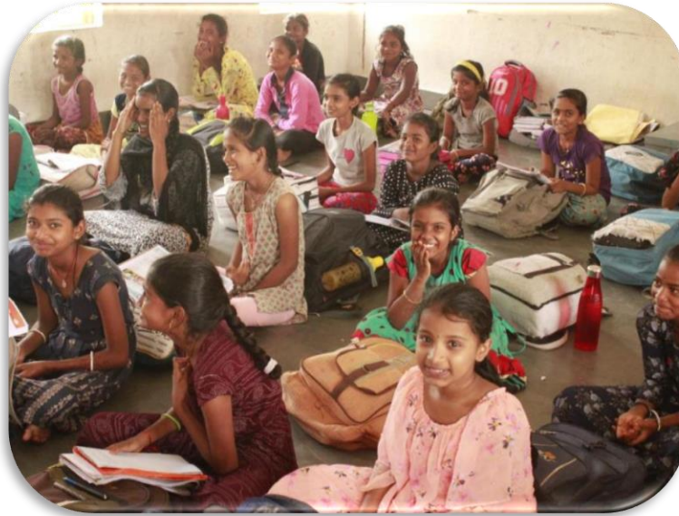
Students paying attention to the Volunteers