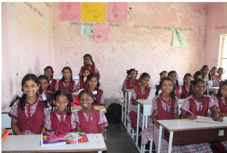
Students interacting with volunteers about human rights and child abuse.