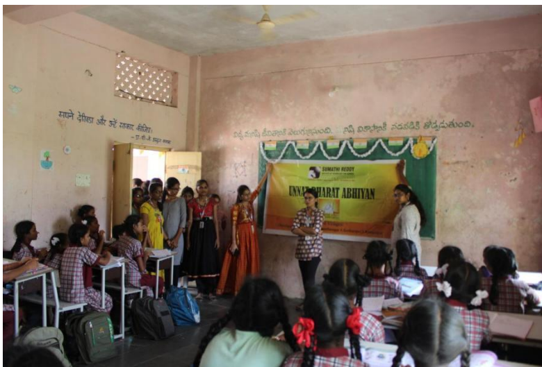
Volunteers are explaining about human rights and child abuse to students.